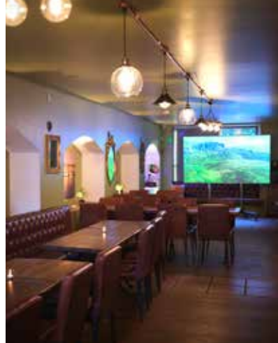
MAIN DINING, SEATS 60 / STANDING 80